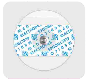
MLGLT-14, Liquid, | MSGLT-14G, Solid Size: Ø 50 x 1 mm Foam