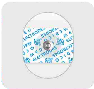
MLGLT-02, Liquid | MSGLT-04, Solid Size: 50 x 38 x 1 mm | 50 x 35 x 1 mm Foam