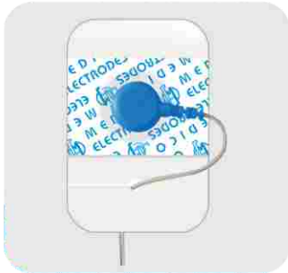
MLGLT-01, Liquid | MSGLT-01G, Solid Size: 57 x 38 x 1 mm Foam