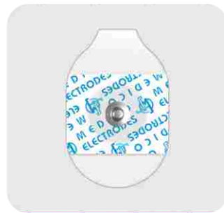
MSGLT-09, Solid Size: 51 x 33 x 1 mm Foam