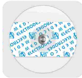
MLGLT-15, Liquid, | MSGLT-15G, Solid Size: Ø 55 x 1 mm Foam