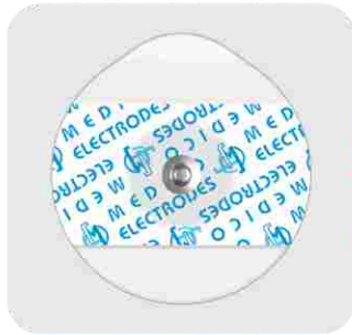
MLGLT-03, Liquid | MSGLT-03G, Solid Size: 50 x 48 x 1 mm Foam