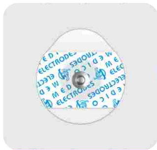
MSGLT-08G, Solid Size: 45 x 42 x 1 mm Foam